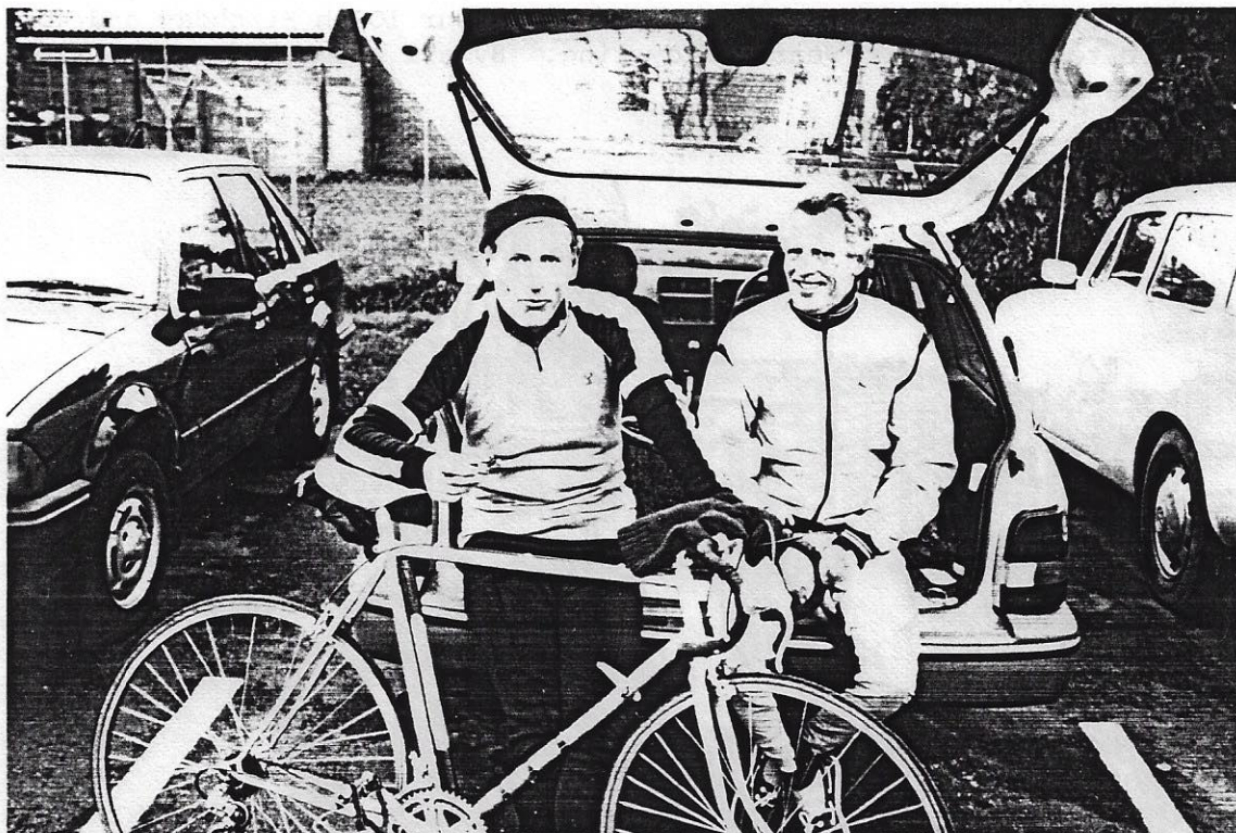
"Sun God" Landless at Herstroncoex.