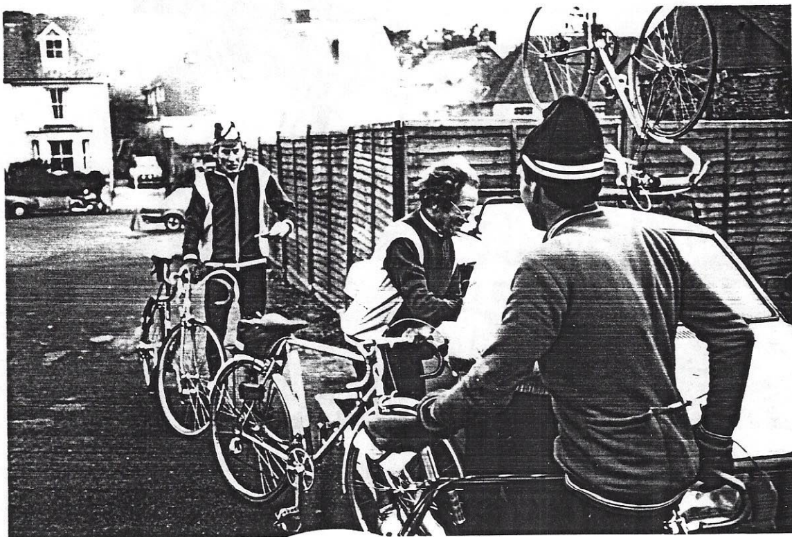
W.E.C.C. members preparing for the "off" in the Reliability Trial.